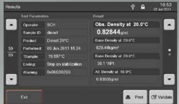
Data Management Function