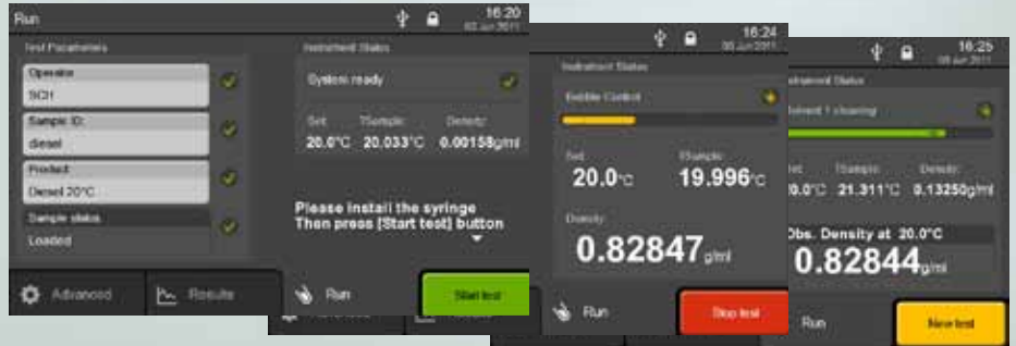
Test progress continuous display