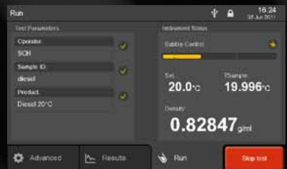
Built-in, automatic bubble detection