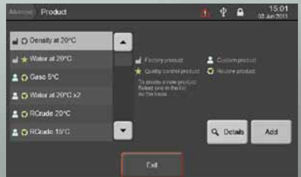
Up to 40 Customizable Products